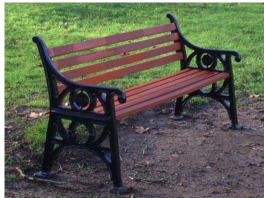
Existing Eastgate bench by the deer enclosure

In the General Park areas the design was the basic ‘Pointer Seat’ with a golden finish to the timbers.